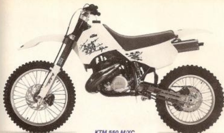
KTM 550 M/XC